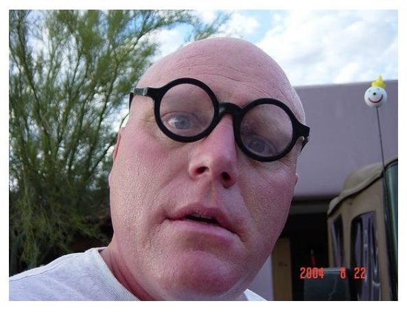
Who was that masked man ???