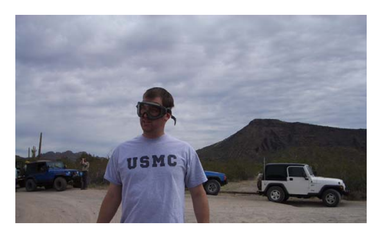
Uh, take me to your leader!