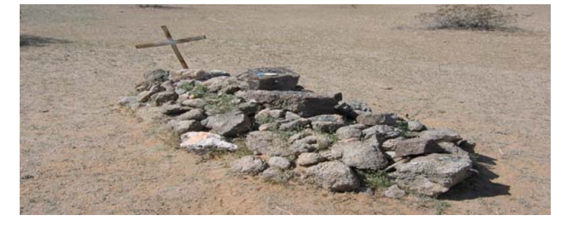
Just one of the many old gravesites of the Devils victims!

with Georges group and took a group picture then headed towards the moondust and night 2's camp. Monday morning those who needed to got their video stamp for Area B and they and a few from the other group spent the day exploring new areas before heading home.