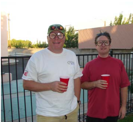
Tweedle Dee and.....