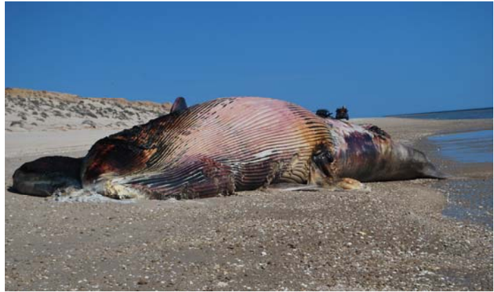
Sushi on the beach – Sea of Cortez Trip