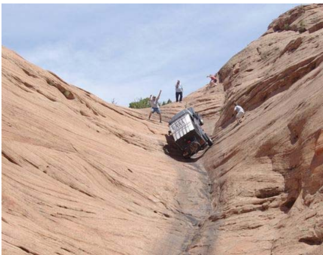
Number 7 almost rolling over backwards On Hell’s Gate, Hell’s Revenge, Moab

There were so many great pictures this quarter that it was impossible to pick one !