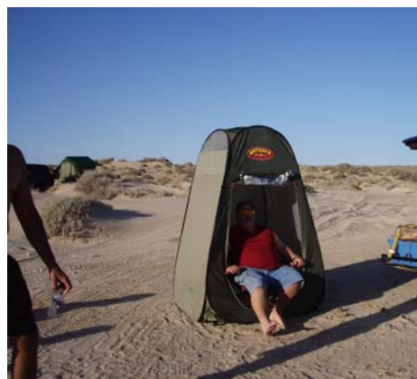
Escaping the sun- in the Outhouse ?