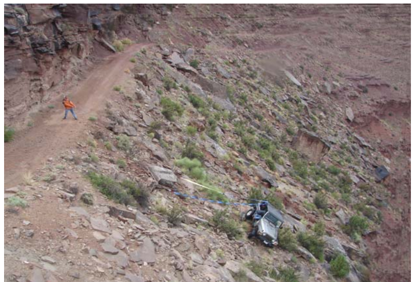
Russ Chungs slide off the trail on White Rim Trail Moab at Murphy’s Hogback