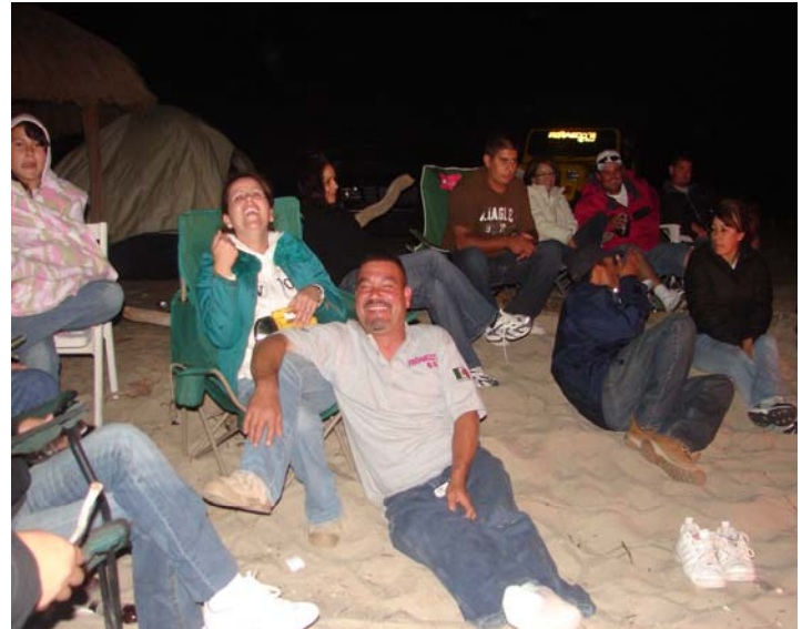
Good friends, beer & a private beach !