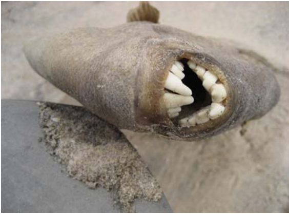
A WV fish we found in Mexico