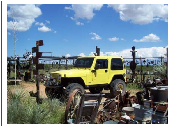
What a collection of “stuff”