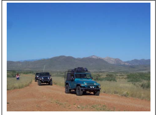
Clean air, clear skies and Jeeps !