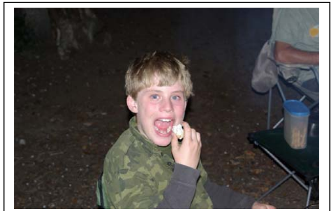
Marshmallows brings out the kid in all of us !