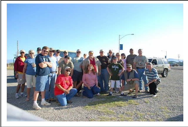
The “Motley Crue” ready for Cochise