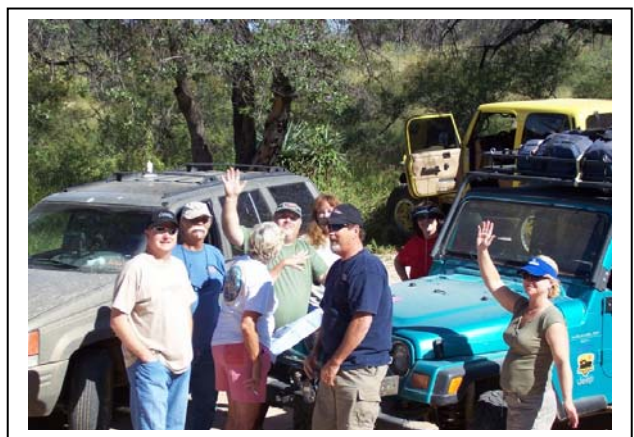
Some Baja planning at a stop