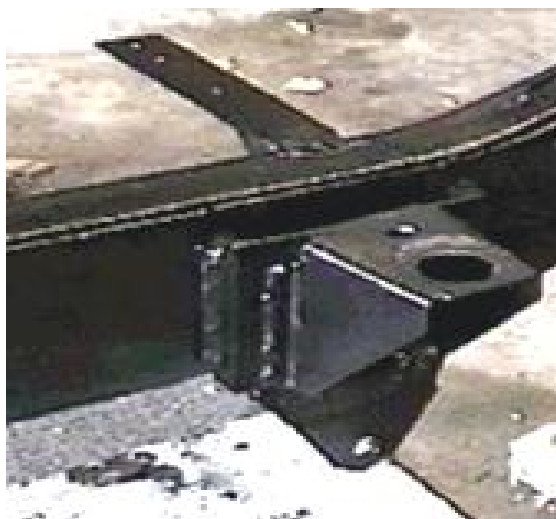
(above, the new rear body mount in the correct place)

2. The body mounts on the rear cross-member need to be "elongated" about 1-3/4" OUT towards the outside edge of the body on each side... You'll just have to measure your tub to get the correct distance for sure, but they are almost on the outside edge of the YJ bodies and on the CJ's they're a little further in toward the center. Pretty easy deal if you have a grinder or dremel tool or even better yet a cutting torch ( I used a die grinder to cut away the excess on my frame)